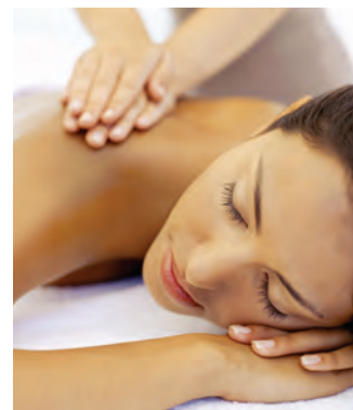
Massage Envy offers massages and more.

After the stressful whirlwind of holiday shopping, a two-hour deep tissue massage—and a healthy skin facial—may be just the thing you need. If that's the case, Massage Envy is the place to go. With several locations around Fairfield County, it offers memberships and gift cards so you can keep the relaxation going all year long—for yourself, or your friends and family. Massageenvy.com