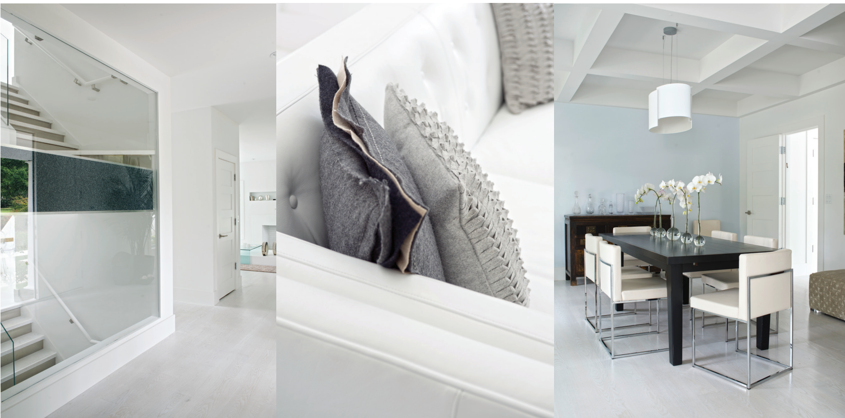
The glass staircase allows for views from the front door all the way through the home to the backyard. In the dining room, Phillip Jeffries's "Lacquered Walls" covers one wall. "The color that I picked was actually a bright white, but it casts a very pale blue—my intention was for it to be white!" laughs Terri. The buffet is an antique.

Together, they settled on a shingled New England Colonial style for the home's exterior, and a more modern interior with an open layout and a palette of stainless steel, concrete, and glass. From there, "it really evolved" says Greenberg. "We started with a basic set of plans, and then all the details—the glass railings, the windows, all the things that make it a special house—kind of came out along the way."