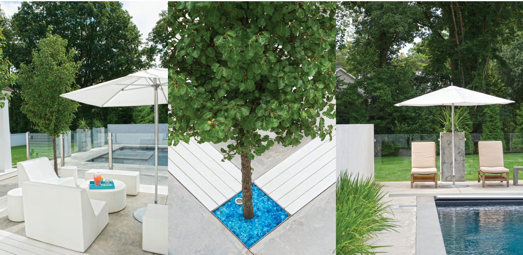
Glass, concrete, and stainless steel are used in the outdoor design as well. A few years in, the grass in the planters was replaced with blue glass. opposite: The seating and dining areas on the "summer patio" are surrounded by white Trex slats that break up the concrete of the deck.

and for two weeks every April, the family enjoys the trees' gorgeous white blooms.