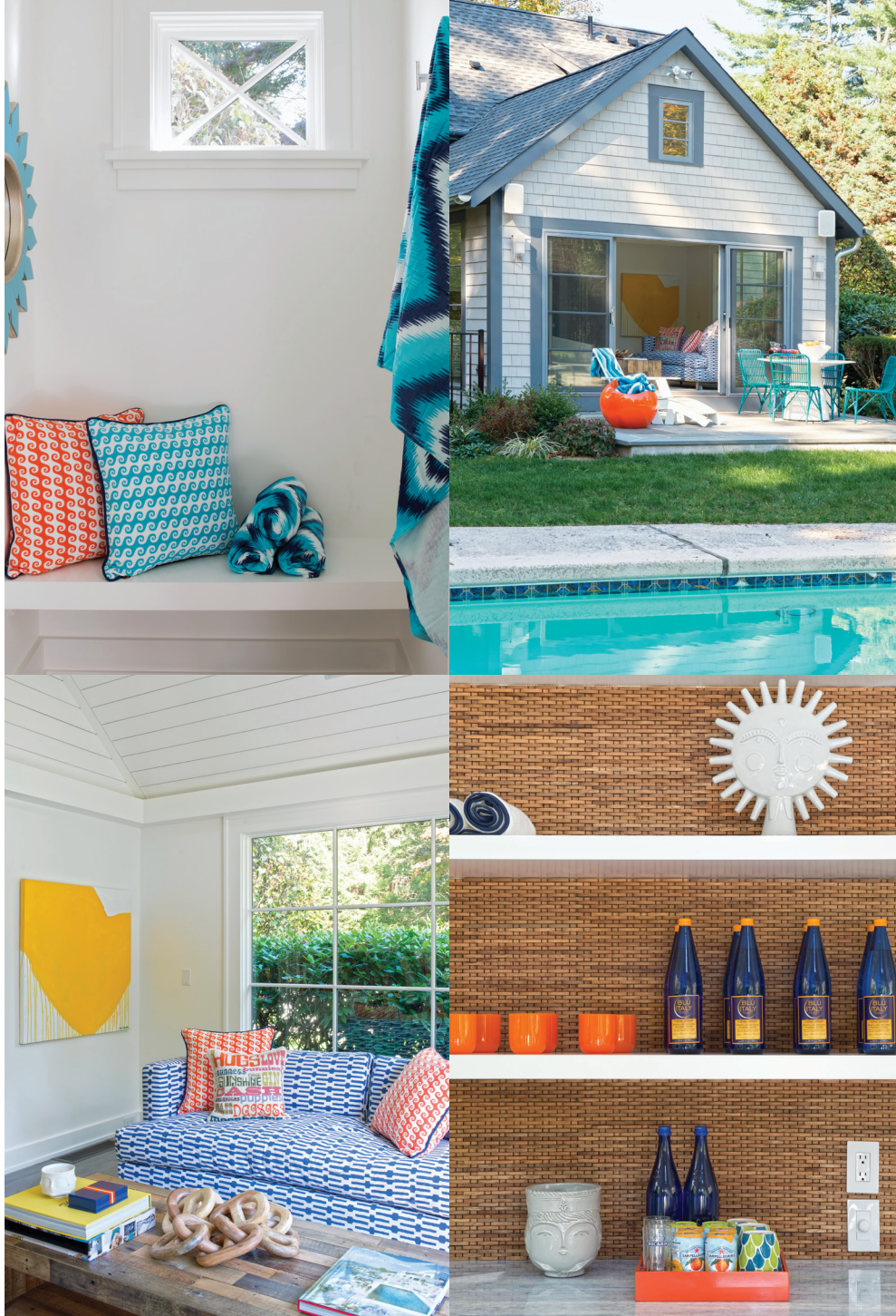
opposite: The former master bedroom is now the pool room, with the addition of a vaulted ceiling, bar with teak backsplash, and funky custom sofa.